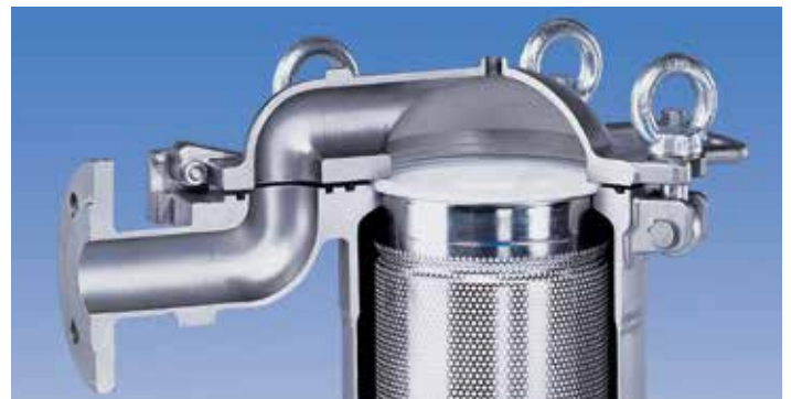
Top inlet connection with hinged cover make filter bag change-outs quick and easy